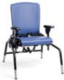
Large standard base R860 Rifton Activity Chair