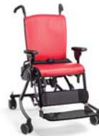
Large hi/lo base R870 Rifton Activity Chair