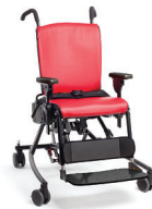
Large hi/lo base R870 Rifton Activity Chair