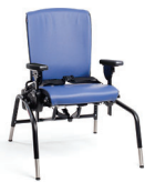
Large standard base R860 Rifton Activity Chair