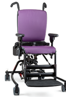
Large hi/lo base R870 Rifton Activity Chair