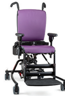
Large hi/lo base R870 Rifton Activity Chair