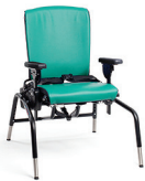
Large standard base R860 Rifton Activity Chair