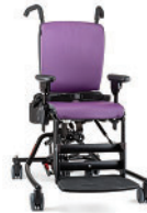
Large hi/lo base R870 Rifton Activity Chair