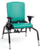
Large standard base R860 Rifton Activity Chair